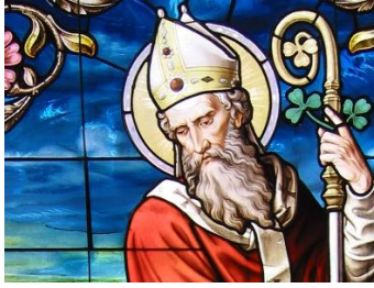
St. Patrick Patron Saint and National Apostle of Ireland

I arise today Through the strength of heaven; Light of the sun, Splendor of fire, Speed of lightning, Swiftness of the wind, Depth of the sea, Stability of the earth, Firmness of the rock. I arise today Through God's strength to pilot me; God's might to uphold me, God's wisdom to guide me, God's eye to look before me, God's ear to hear me, God's word to speak for me, God's hand to guard me, God's way to lie before me,