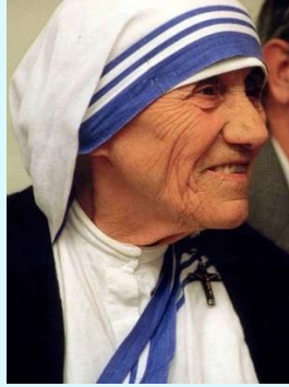
St. Mother Teresa of Calcutta Memorial – September 5

...I heard the call to give up all and to follow Him into the slums—to serve Him in the poorest of the poor...I knew it was His will and that I had to follow Him. There was no doubt that it was going to be His work. ~Saint Mother Teresa