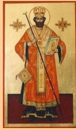
St. Valentine February 14