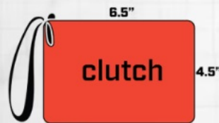
SMALL PURSES OR CLUTCH BAGS